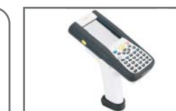
PG-100 Easy operate pistol grip.