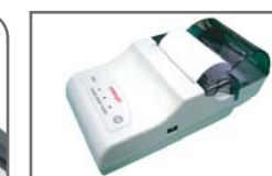
MP-300 Portable mobile 2" wireless thermal printer.