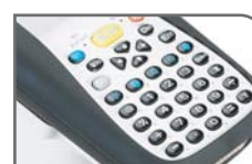
Large keypad with 36 keys (MT-2000) or 21 keys (MT-2010).