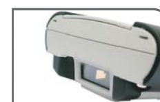
Option Laser Barcode Scanner LS-200 in MT-2000 series.

Posiflex mobile terminal series, MT-2000/2010, is designed to meet your specific business demand and environment with great mobility. Solidly made with 2 colors, double injection plastic & rubber molding case, MT series is both shock and water resistant to withstand the impact of accidental drop of device and the moist of harsh operation environment. Integrated with data entry, barcode scanning, receipt printing connection, and wireless data transmission technology.