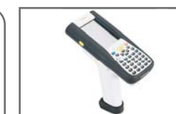
PG-100 Easy operate pistol grip.