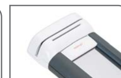
MD-200 Separately purchased MSR / Smart Card Reader option .