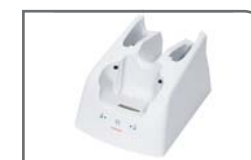
DS-100 Optional Cradle for the terminal and 2 additional batteries recharge, LAN port, USB port and indicators.

** The product information and specifications are subject to change without prior notice.