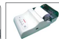
MP-300 Portable mobile 2" wireless thermal printer.