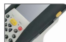
Built-in SD card reader.